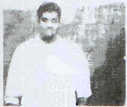
Ist Party -यासकर्ता