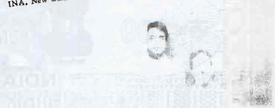
IInd Party Witness गवाह

[Faint, mostly illegible text in Hindi, likely the main body of the registration document.]